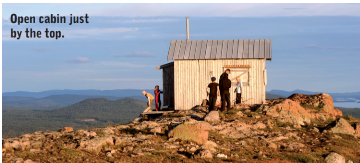
Open cabin just by the top.

Nature: From pine forest at the starting point with blueberries, lingonberries and crowberries, where extensive logging and planting has been carried out, to natural forest with traces of older, selective logging closest to the top. At the tree line there is a small marshland where the moorland spotted orchid grows, then mountain heath with shrubs and willow takes over. By the cabin at the top there are rock outcrops and boulders, mountain birch and purple mountain heather.