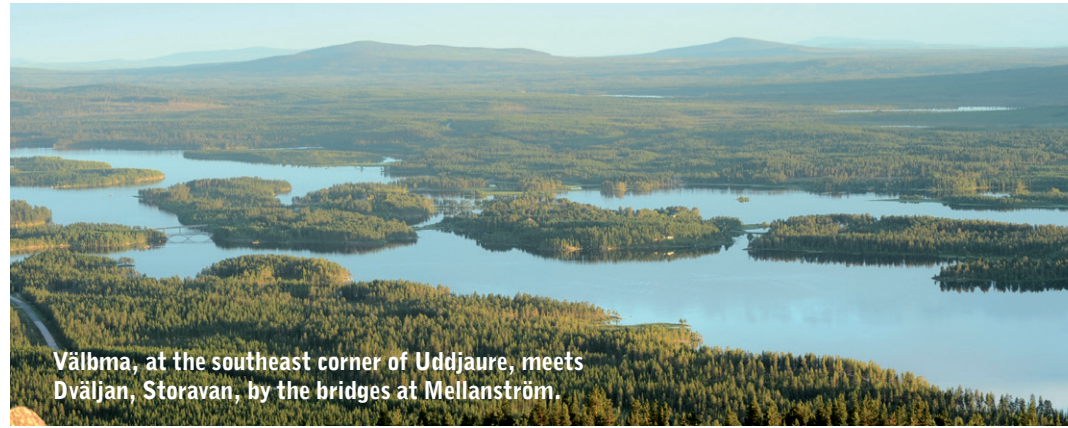
Veälbmá, at the southeast corner of Uddjaure, meets Dväljan, Storavan, by the bridges at Mellanström.

The trail guide series is published by Arjeplog Municipality using state aid for local nature conservation projects (LONA) through the County Administrative Board of Norrbotten. Feel free to use the mountain map to plan your hikes: www.kso2.lantmateriet.se . The guides are available for download here: www.arjeplog.se/utflyktsguider . Arjeplog Municipality © the Swedish National Land Survey, Geo-Data Cooperation.