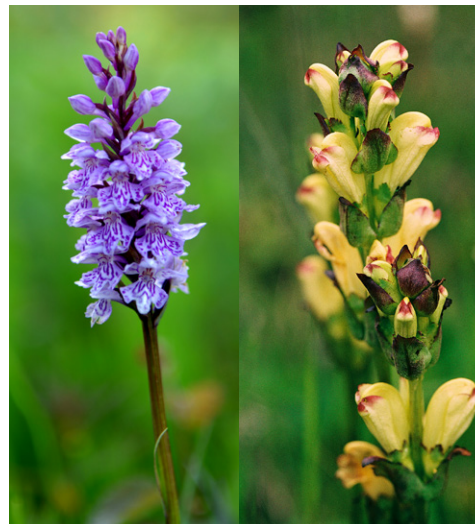
Moorland spotted orchid Dactylorhiza maculata and moor-king lousewort Pedicularis sceptrum-carolinum grow by the tree line.

Nature: From pine forest at the starting point with blueberries, lingonberries and crowberries, where extensive logging and planting has been carried out, to natural forest with traces of older, selective logging closest to the top. At the tree line there is a small marshland where the moorland spotted orchid grows, then mountain heath with shrubs and willow takes over. By the cabin at the top there are rock outcrops and boulders, mountain birch and purple mountain heather.