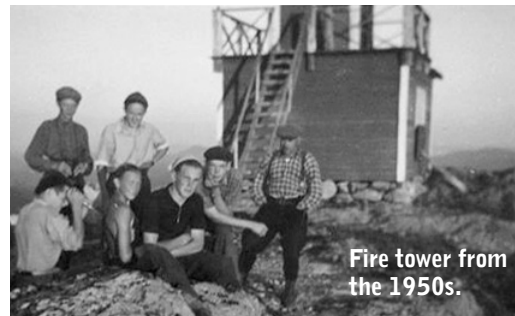
Fire tower from the 1950s.

In the beginning of the 20th century a fire watch tower was built on the peak. In summer there was staff on site. Operations ceased