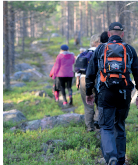
The path begins in a pine forest. After a kilometre the ascent begins. The steepest section features gravel and small stones.

View: Lake Uddjaur fills the view with its islet-crowded archipelago landscape. The nearest villages are Mellanström and Kasker, south and south-west of the peak. In Sámi veälbmá means calmly flowing water, a backwater, possibly with much greenery around. Buovdda means 'bald head'. From the north side of the peak you can see Lake Hornavan and in the north-west the border mountains in Norway.