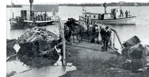
Boat traffic used to be regular on Uddjaure, as well as timber rafting.

during the 1960s when the tower blew down. Veälbmábuovdda used to be a popular hiking destination, especially during summer weekends. Further reading: Mullholm – in the middle of Lapland [Mullholm – in the middle of Lapland], by Lise-Lotte B Modig (2006).