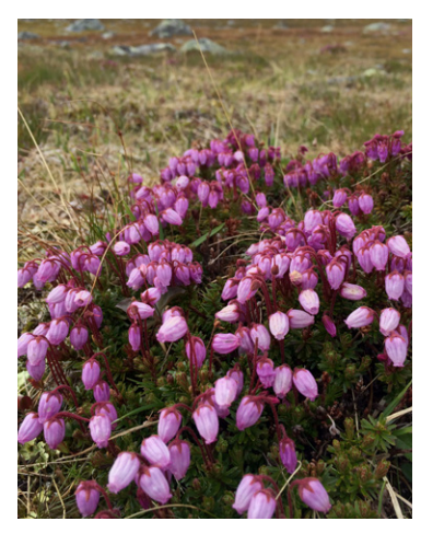
Purple mountain heather Phyllodoce caerulea

Bark harvest along the trail. The inner bark has been used as food throughout the Sámi settlement area in Northern Europe, but not on the Kola peninsula. Bark has been used in the same way by Siberian people and native Americans in North America.